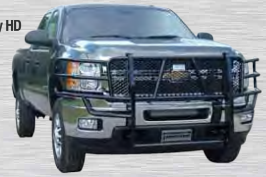
Chevy HD 2011

The "Legend Series Grille Guard" is the most popular heavy-duty grille guard on the market today for full size and mid-size vehicles. Ranch Hand combines durability and protection with sleek lines that compliment your vehicle. Standard features include custom punched grille insert, loop supports, and the highest quality black powder coat finish in the industry.