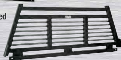
Full Louvered 2 inch