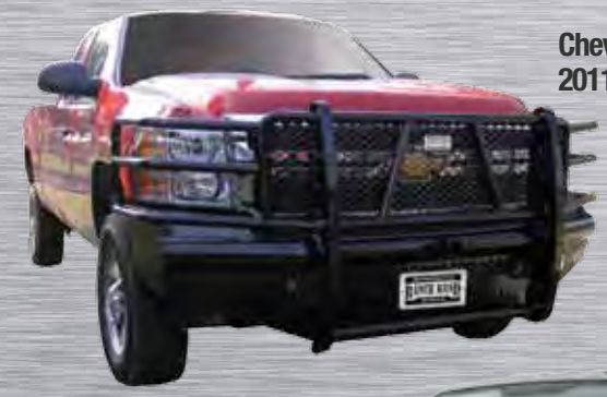
Chevy HD 2011