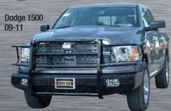
Dodge 1500 09-11