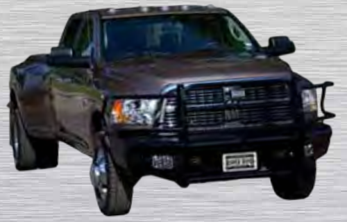
Dodge 2500/3500 2010

"Legend Front End Replacement" known for its legendary quality is manufactured with 4" Schedule 40 Pipe and provides maximum protection for your vehicle. It is designed to take an impact both on and off the road and comes standard with a 2" receiver. Field tested in extreme conditions, this is the toughest product on the market today. Most applications retain factory fog lights and tow hooks.