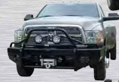
Dodge 2500/3500 2010