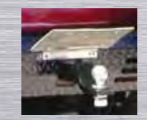
Patented Hidden 2" Receiver (H2R) Shown with Ball Mount