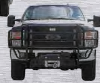
Winch Ready Grille Guard 08-10 Ford SD only