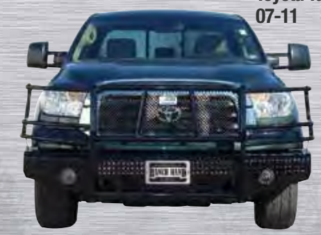
Toyota Tundra 07-11