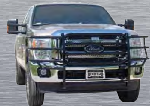
Ford SD 2011