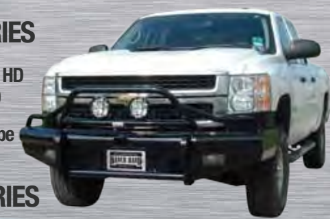
4" Schedule 40 Pipe