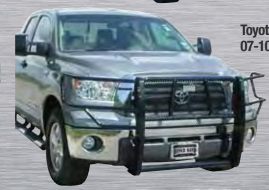
Toyota Tundra 07-10

The "Bullnose Front End Replacement" has off road styling with 12 gauge contoured skirts to protect the underside of your truck. Off Road Light tabs standard on all models.