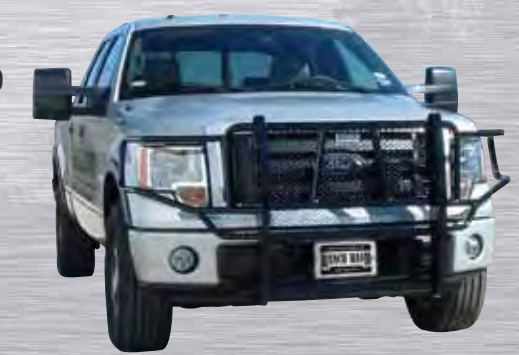
Ford F150 09-10

The "Legend Series Grille Guard" is the most popular heavy-duty grille guard on the market today for full size and mid-size vehicles. Ranch Hand combines durability and protection with sleek lines that compliment your vehicle. Standard features include custom punched grille insert, loop supports, and the highest quality black powder coat finish in the industry.