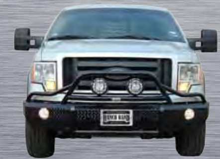
Ford F150 09-11