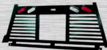
Hauler with Lights Window Cut

The Ranch Hand louvered "Headache Rack" comes in two styles: Standard 2" and the Hauler with lights. Both styles are made of heavyduty square tubing with or without window cut and must be installed with short or long rails. Light duty headache rack option available.