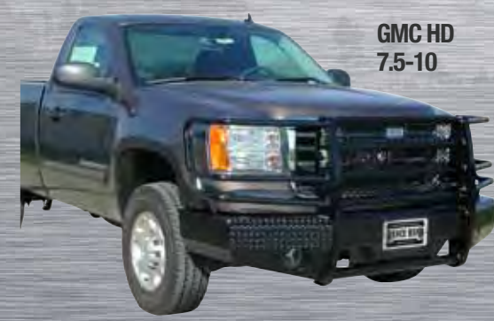
GMC HD 7.5-10